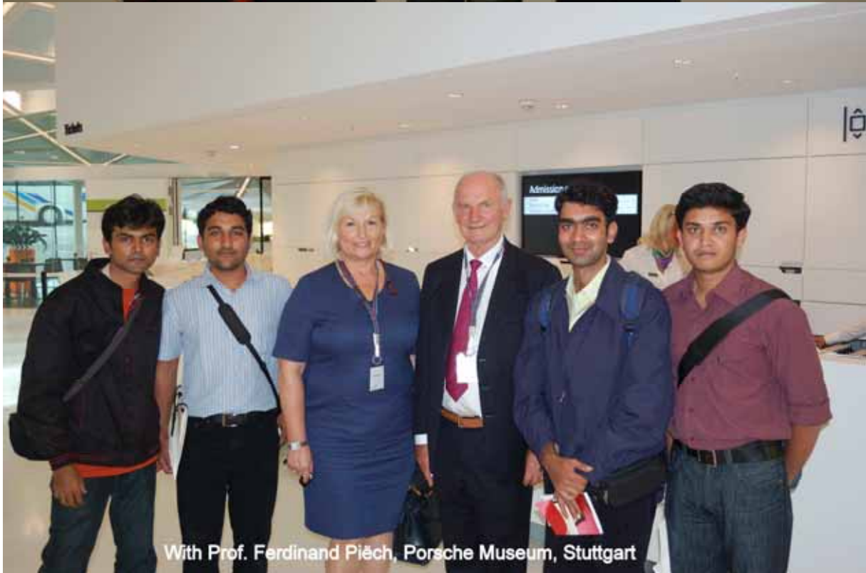
With Prof. Ferdinand Piëch, Porsche Museum, Stuttgart