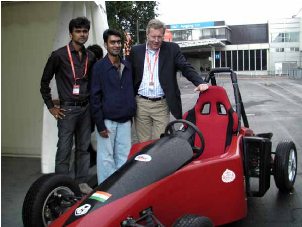
President from Germany Christian Wulff and Studenten from Sinhgad College of Engineering, Pune. With Hybridcar.