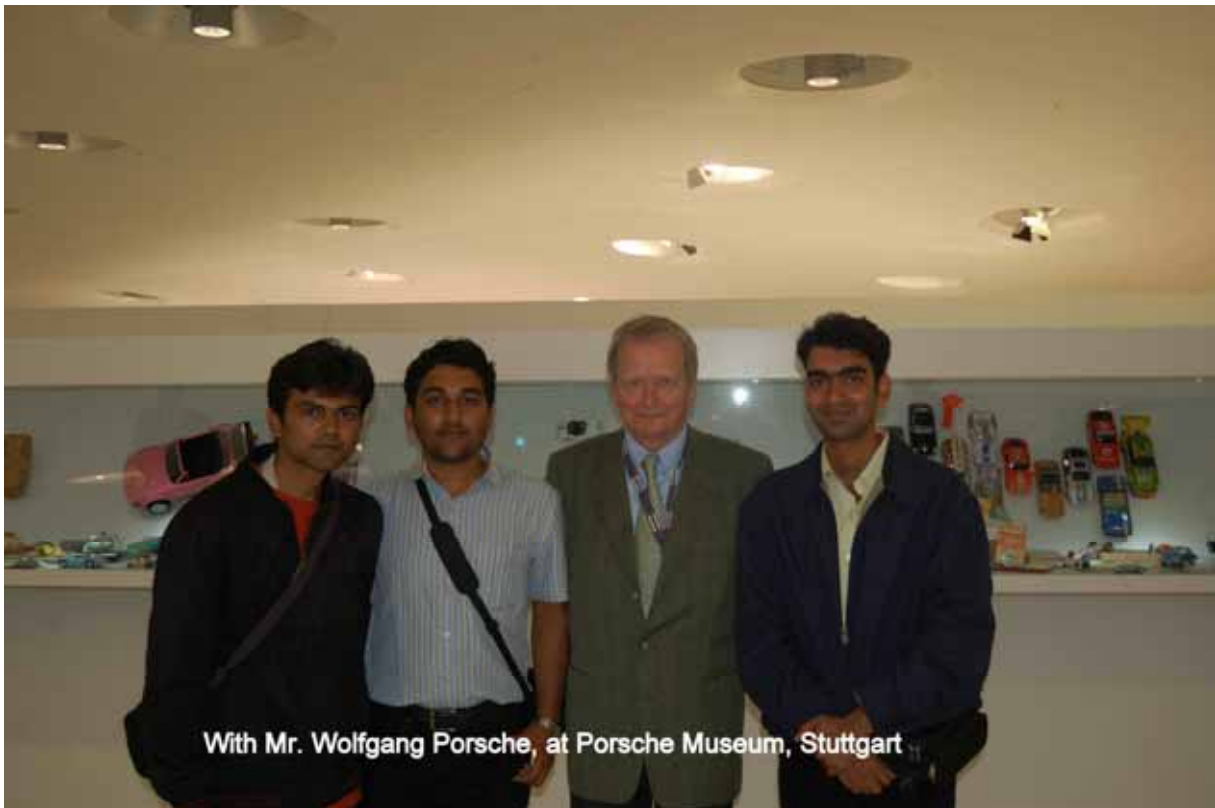
With Mr. Wolfgang Porsche, at Porsche Museum, Stuttgart